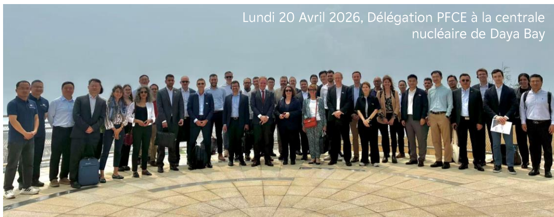
Lundi 20 Avril 2026, Délégation PFCE à la centrale nucléaire de Daya Bay